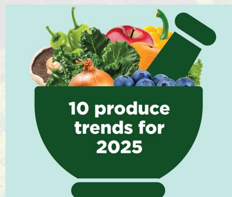
Produce trends for 2025