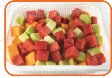
#180879 CUBED MELON MIX watermelon, cantaloupe & honeydew • 5LB