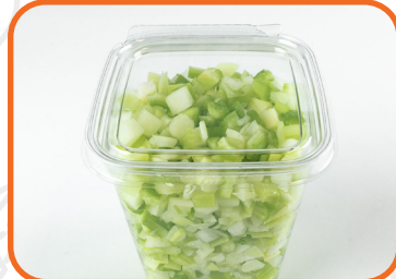
#180863 STUFFING MIX onion & celery 4CT/16OZ