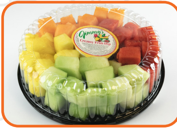
#180901 FRUIT TRAY W/WATERMELON pineapple, watermelon, honeydew, cantaloupe with sour cream fruit dip 2/2.25LB