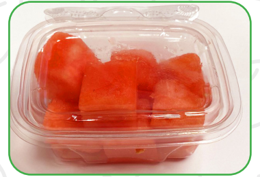
#180919 FRUIT CUP watermelon chunks SOS 24/4oz