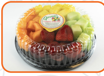
#180900 FRUIT TRAY W/STRAWBERRIES stawberries, honeydew, cantaloupe with sour cream fruit dip 2/2.25LB