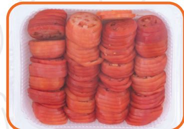
#180421 TOMATO SLICED 3/16" (MCT) 5LB