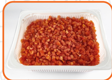
#180742 ROMA TOMATO DICED 3/8" (MCT) 2/5LB