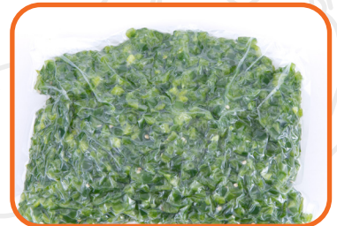
#180761 DICED GREEN PEPPER 5LB