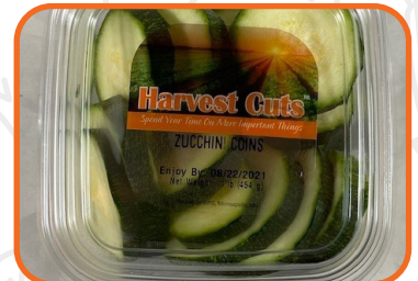
#180903 ZUCCHINI COINS 4CT/16OZ