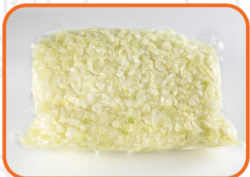
#180505 DICED YELLOW ONION 5LB