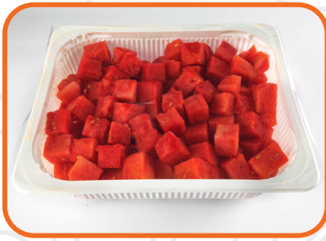
#180773 WATERMELON CUBED 5LB