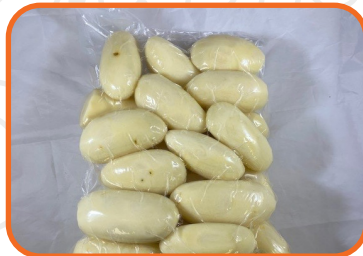
#180767 WHOLE PEELLED RUSSET POTATO 2/10LB