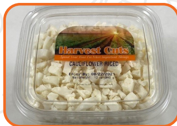
CAULIFLOWER RICE #180902 • 4/12oz #180912 • 1/5lb