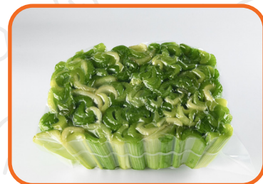
#180504 CELERY STICKS 4/5LB