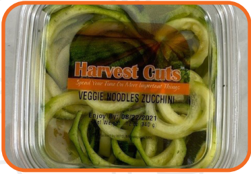
ZUCCHINI NOODLES #180904 • 4/12oz #180909 • 2/2lb