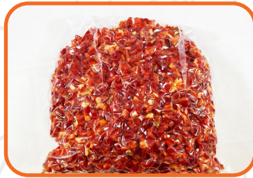
#101750 DICED RED PEPPER 5LB