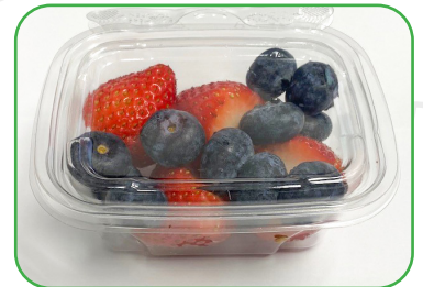
#180929 FRUIT CUP strawberries & blueberries SOS 24/4oz