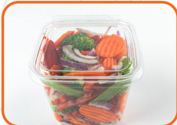
#180895 STIR FRY TRAY carrot, pea, pepper, red onion 4CT/14OZ