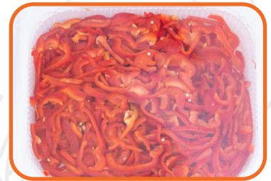
#101841 SLICED RED PEPPER 5LB