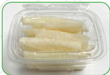
#180930 VEGGIE CUP jicama sticks SOS 24/4oz