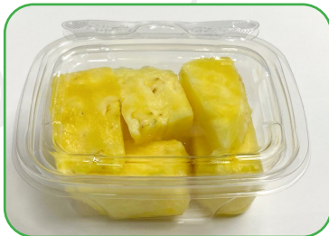
#180920 FRUIT CUP pineapple chunks SOS 24/4oz