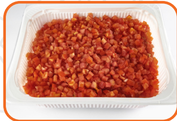
#180355 DICED TOMATOES 4/5LB