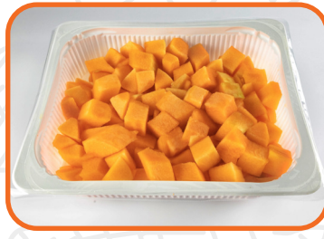
#180771 CANTALOUPE CUBED 5LB