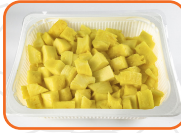
#180774 PINEAPPLE CUBED 5LB