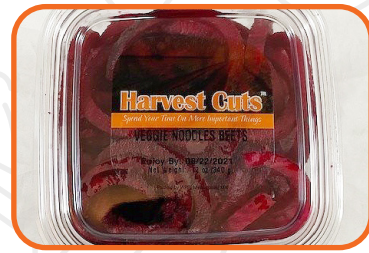
BET NOODLES #180907 • 4/12oz #180911 • 2/2lb