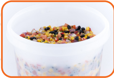
#180420 SALSA PICO SANTE FE PAIL 5LB