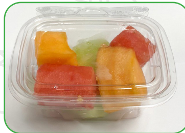
#180923 FRUIT CUP cantaloupe, honeydew, watermelon SOS 24/4oz