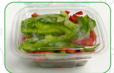
#180932 VEGGIE CUP red, green pepper sticks SOS 24/4oz