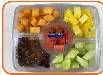
#180898 WATERMELON FRUIT TRAY cantaloupe, honeydew, pineapple, watermelon & red grapes • 2/4LB