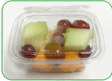
#180917 FRUIT CUP cantaloupe, honeydew, grape SOS 24/4oz