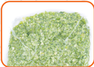
#180755 DICED CELERY 5LB