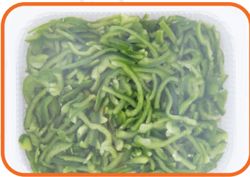
#180399 SLICED GREEN PEPPER 5LB