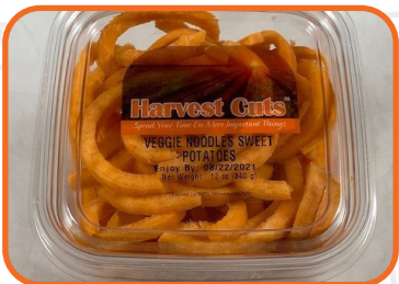
SWEET POTATO NOODLES #180906 • 4/12oz #180910 • 2/2lb