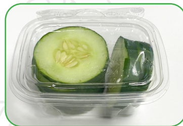
#180931 VEGGIE CUP cucumber slices SOS 24/4oz