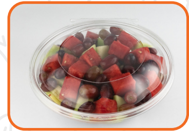
#180896 MELON FRUIT WITH RED GRAPES BOWL cantaloupe, honeydew, watermelon & red grapes • 2/3LB