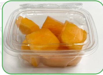
#180918 FRUIT CUP cantaloupe, chunks SOS 24/4oz