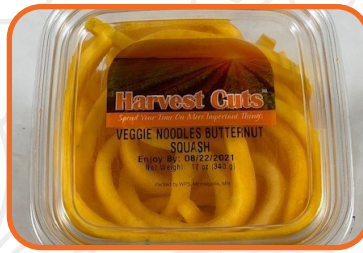
BUTTERNUT SQUASH NOODLES #180905 • 4/12oz #180908 • 2/2lb