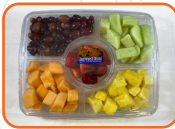
#180899 MELON MIX FRUIT TRAY cantaloupe, honeydew, pineapple, strawberries & red grapes • 2/4LB