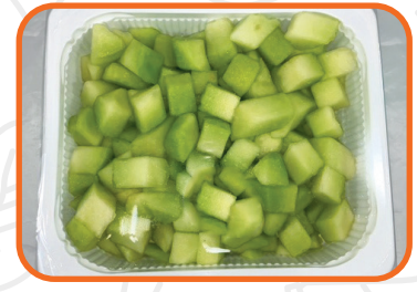
#180157 HONEYDEW CUBED 5LB