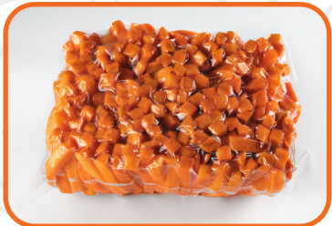
#180786 CARROT STICKS 4/5LB