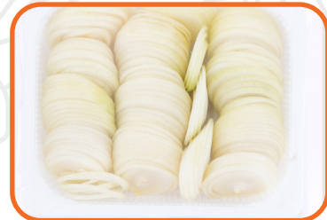
#101835 SLAB ONION 4/5LB