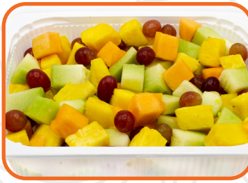
#180806 CUBED FRUIT MIX cantaloupe, honeydew pineapple & red grapes • 5LB