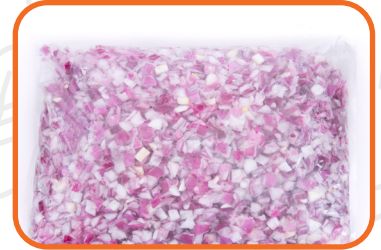
#180798 DICED RED ONION 5LB