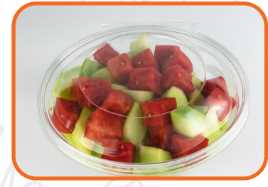
#180897 MELON FRUIT TRAY cantaloupe, honeydew, pineapple 2/3LB