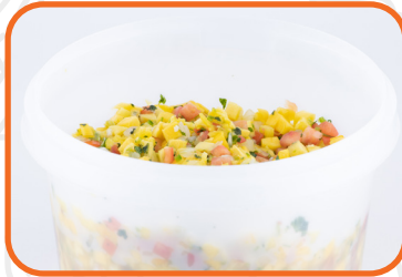
#180944 SALSA PICO TROPICAL 5LB